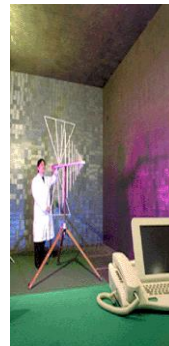
3 meter chamber